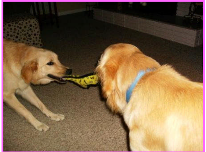
We've all seen this game before! The Classic – TUG OF WAR! And we all know there's always a "Winner" and a "Loser"...