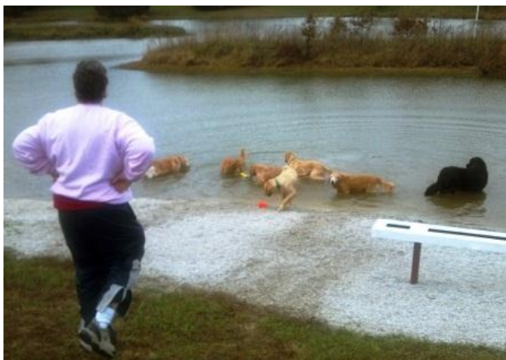
The Moran, Blacksher, Rogers and Callison kids swimming at Canine Country