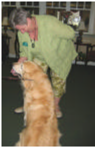
Sunrise Assisted Living-July