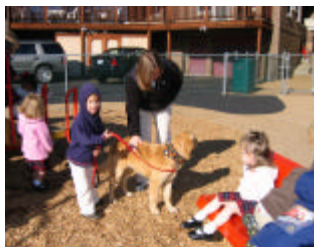
Sacred Heart Preschool Visit- Oct.