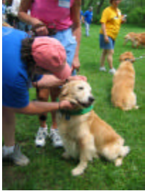
Reunion Picnic- May