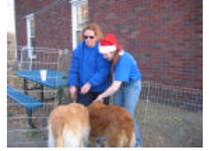
Webster Groves Christmas Walk-Nov.

TO ADOPT OR SURRENDER A DOG, CALL THE GGRR PHONE LINES: