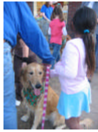
Webster Groves Christmas Walk-Nov.