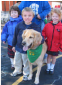
Sacred Heart Preschool Visit-Oct.