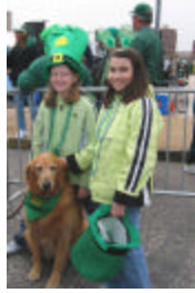
St. Pat's Parade-March