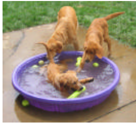
Pups Rescued in July