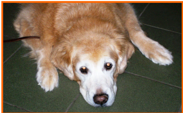
Chloe Rogers waits patiently for our February meeting to be over...