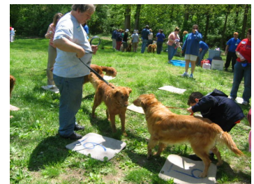
Dog Cake Walk

Turn right at the park entrance. Make an immediate left into