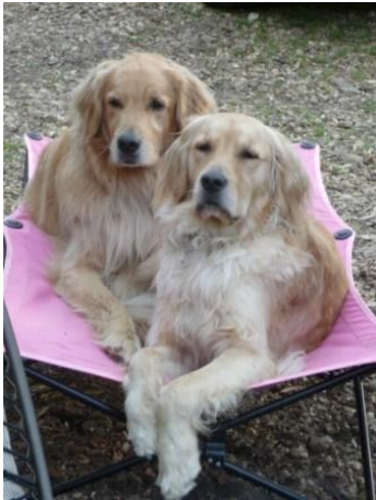
Walter Gerber and Cami Anzelmo are pictured together on a recent camping trip. After a full day of canoeing and a few hot dogs, they cozied up together!

Are you thinking about taking your dog camping? The outdoors is one of the best places to spend time with your dog. The dog loves all the new sights, sounds and smells. Here are a few tips that may make camping with your dog a bit more enjoyable and possibly safer.