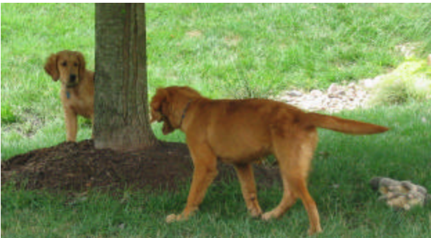
Puppies Little Bit (l) and Hannah (r) play a game of hide and seek. All of the puppies found their forever homes in September.

TO ADOPT OR SURRENDER A DOG, CALL THE GGRR PHONE LINES: