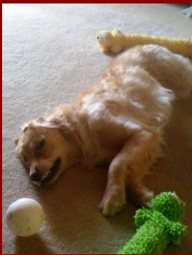
Is that a smile we see on Cami R's face? Maybe it's because she's surrounded by TOYS!

Bring your dogs and enjoy the day at Greentree!