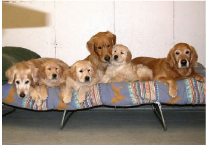
Slider Taylor, who is now 2-1/2 years old, is shown in a 4-generations photo. From left to right are Shawnee, Slider, Slammer, Sydney, Jack, and Sasha. Here comes the hard part—Shawnee (adult on the left) is Sasha's mom; Sasha (adult on the right) is Sydney's mom, and Sydney (adult in the middle) is the mother of Slider, Slammer, and Jack.